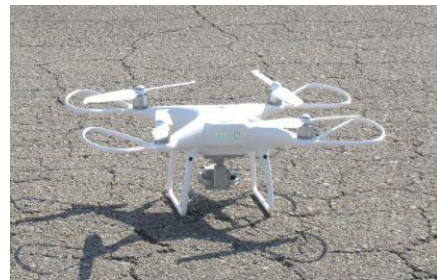
A drone of the Fire Department